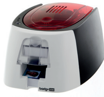
Badgy200 card printer